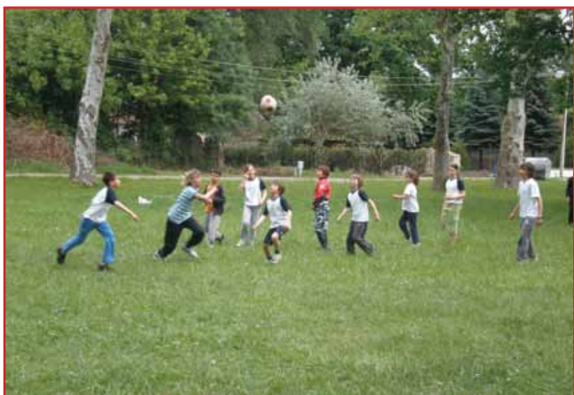
Football games between teams initiated Slovenian team. Still, Serbian team won the tournament.